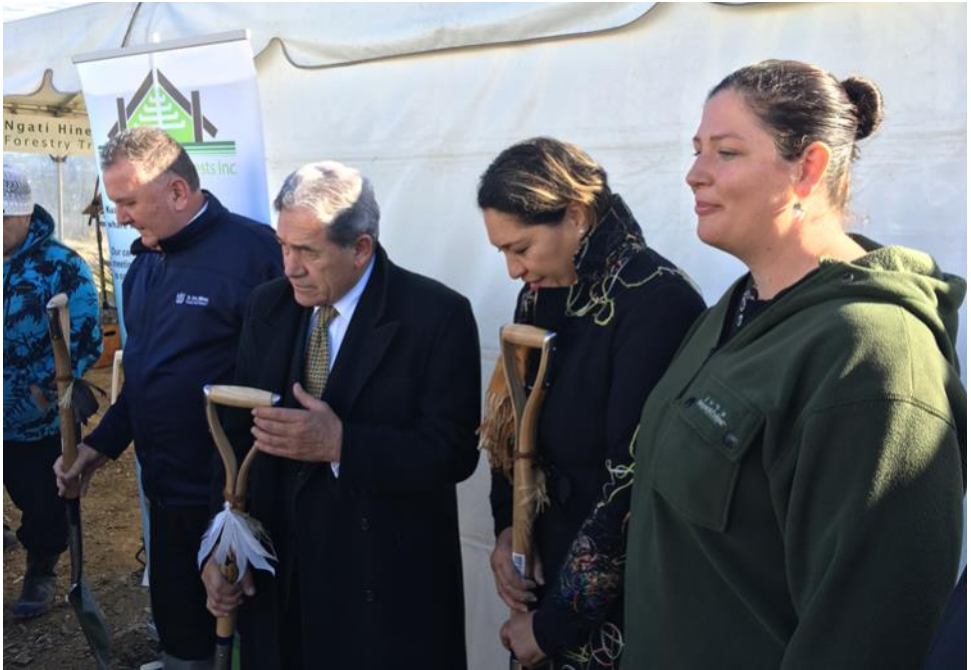
Photo taken at tree planting ceremony from left: Minister of Forestry and Economic Development Hon Shane Jones, Deputy Prime Minister Rt Hon Winston Peters, Associate Minister of Forestry Hon Meka Whaitiri and List MP Willow-Jean Prime.

publicity including significant segments screening on both Maori TV Te Kaea and TV One News on the evening of the 31st.